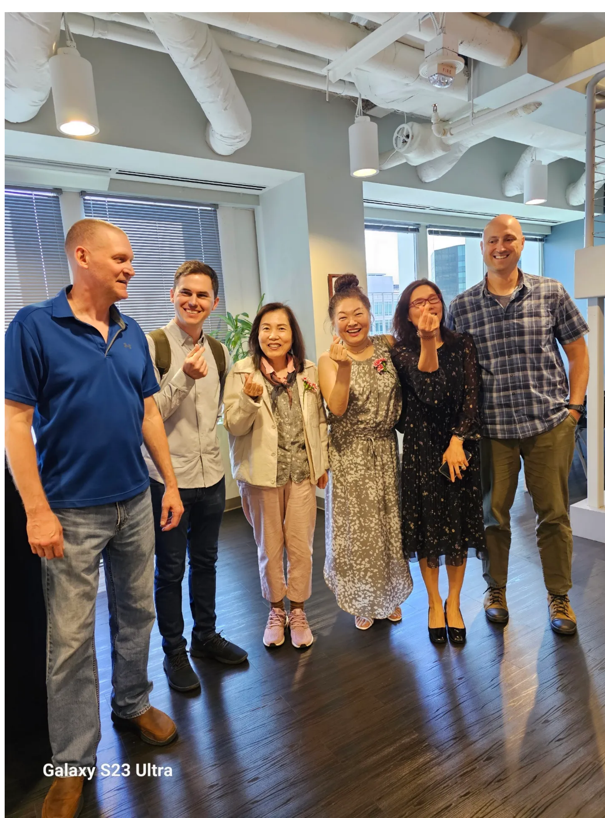
Galaxy S23 Ultra

It was also the last week for one of the Korean students, so we wished him a farewell at the lunch and took a few silly photos.