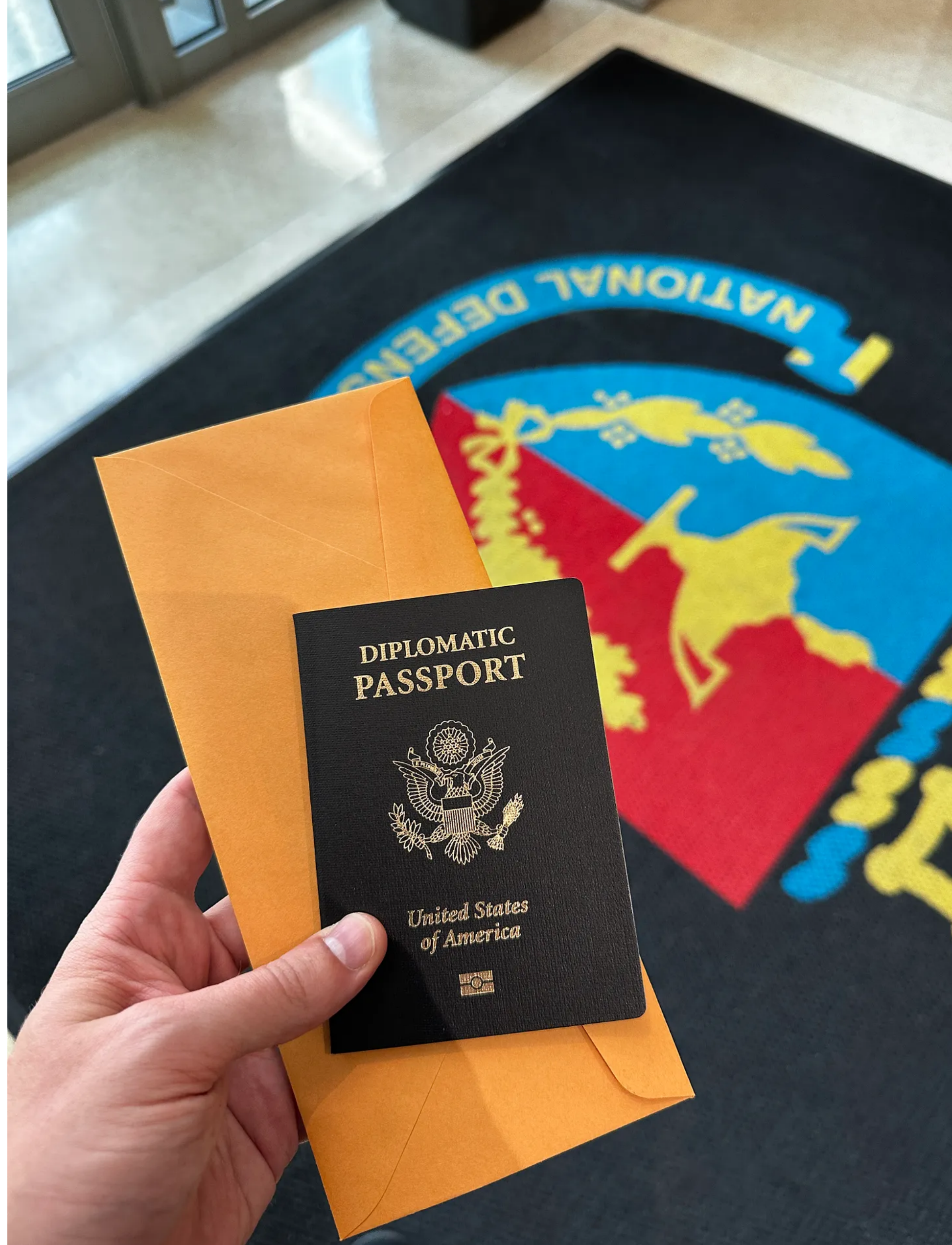
Finally, my visa and official passport are in hand!

Besides finishing up my language school program, I also had to move this month. I had one shipment of my things going to Korea and one shipment of things that will go into long-term storage here in the US. That first move went off without a hitch, but for the second move, the movers just...didn't show up. It was my last weekday in that apartment, and I was assured by the government side that everything was confirmed and good to go, even if I hadn't been able to get a hold of the movers to talk to them myself. Well, when I finally got a human on the line, I found out that the moving company had no idea about my move, so they offered to give me a date the following week. This was not acceptable, so I pulled the levers I could to get the movers out that day while moving myself out to the loading dock in preparation to move everything myself into a U-Haul truck as a last-ditch measure. It was not a good day, but I guess I learned yet again that you need to be annoyingly persistent on the front end with any government work.