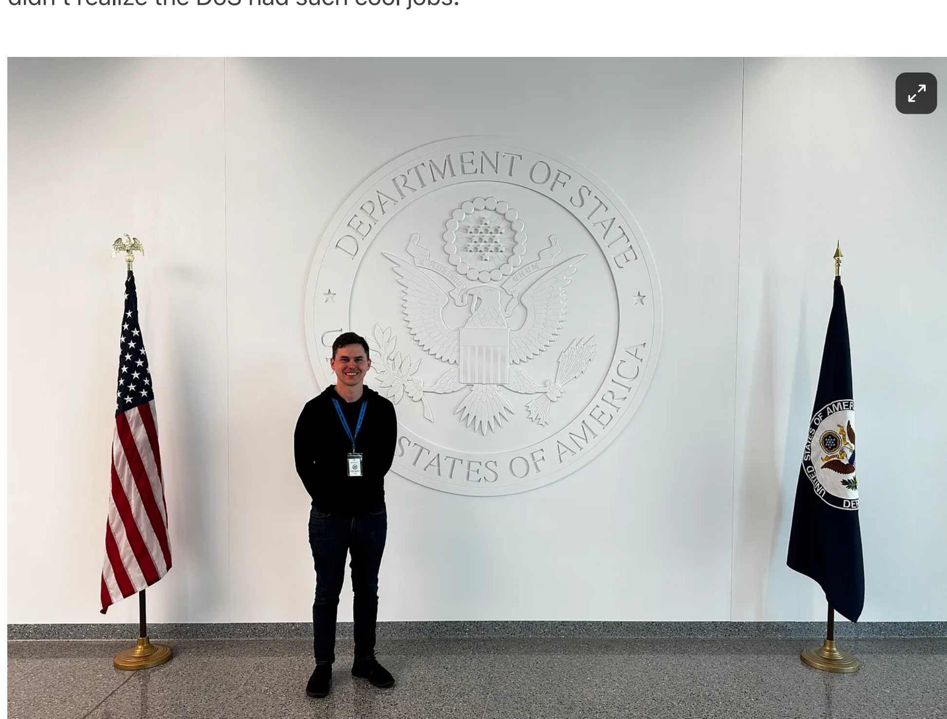
Department of State training

That brings us to the present time, where I'm attending a week-long course at the Department of State. The course is primarily designed for diplomats going to posts around the world, but as I'll fall under the US Embassy umbrella for my time in Korea, I get to take the course too. It's been a rewarding experience so far, and it's been nice to see how the Department of State runs training courses as compared to the similar military courses I've taken in the past. The course also refreshed some stale skills and allowed me to meet many interesting diplomats with experience all around the globe. I didn't realize the DoS had such cool jobs!